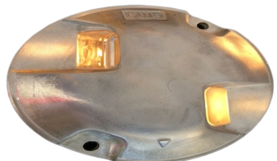
Inset light after cleaning