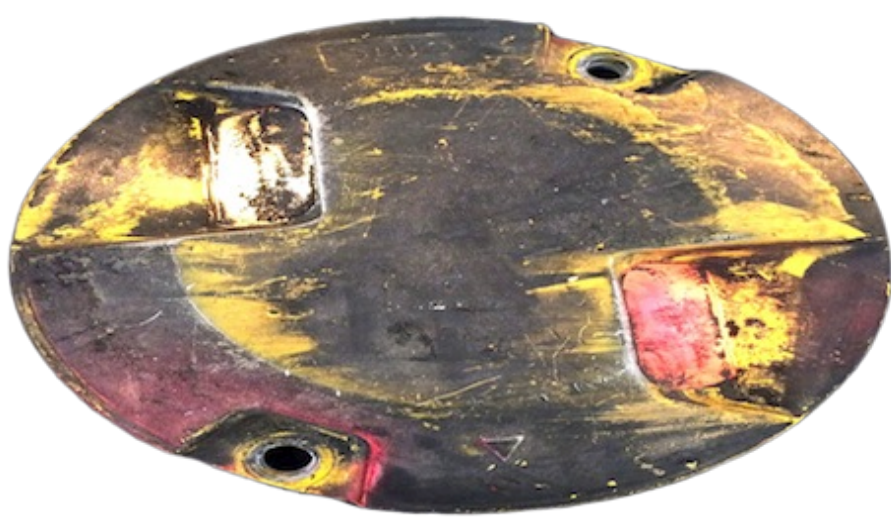
Inset light before cleaning

Nowadays, new solutions are emerging. Vegetal powder or soda powder are replacing dry-ice. They provide same cleaning efficiency and are simple to store.